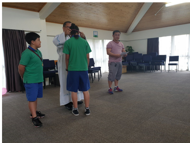
Filipino speech competition winners late last term.