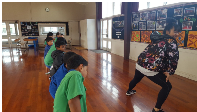
Kiwisport: Hip Hop Term 3 2018