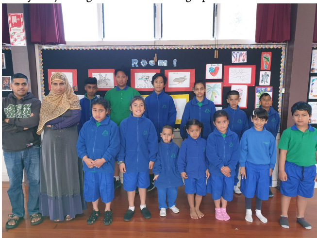
Welcome to our new families