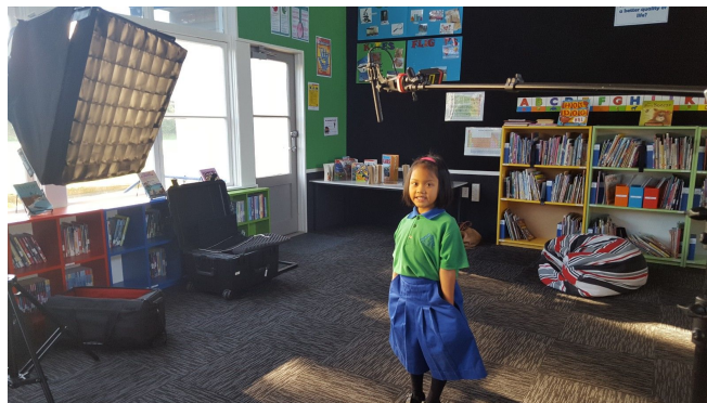
Filming for 7 Days earlier last term.

Here are some photos of our fantastic students learning in action.