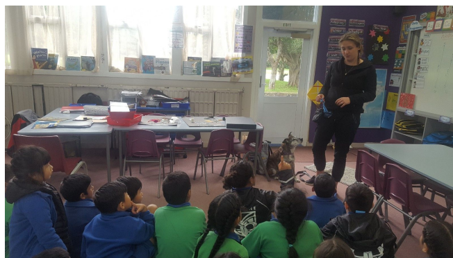
Dog safety talk with Room 1